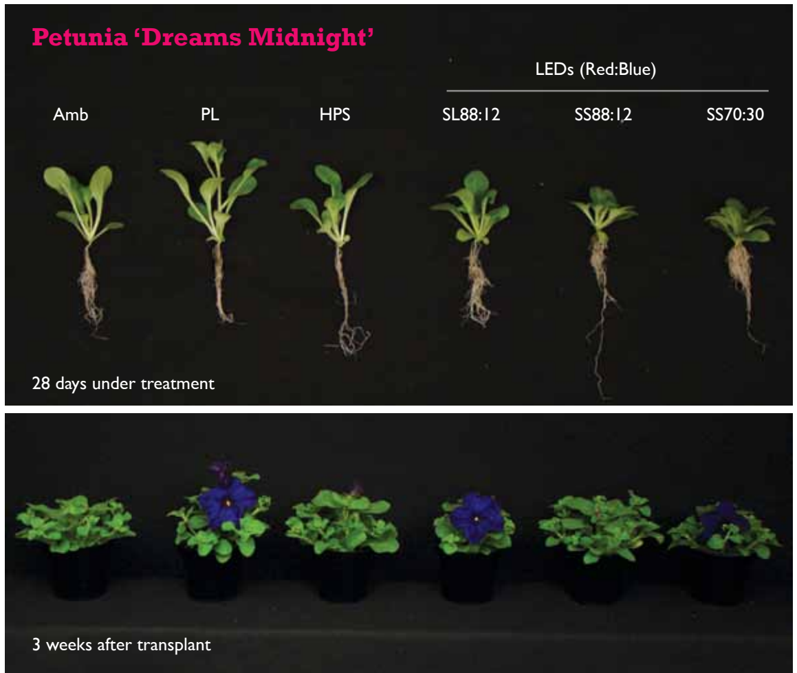
Figure 4. Plug quality and subsequent flowering of petunia plugs grown under ambient solar light, supplemental lighting (SL) from plasma lamps (PL), high-pressure sodium lamps (HPS) and LEDs (SL88:12) delivering 70 \mu\text{mol}\cdot\text{m}^{-2}\cdot\text{s}^{-1} or sole-source (SS) LEDs (SS88:12 and SS70:30) in a vertical production system delivering 185 \mu\text{mol}\cdot\text{m}^{-2}\cdot\text{s}^{-1} .