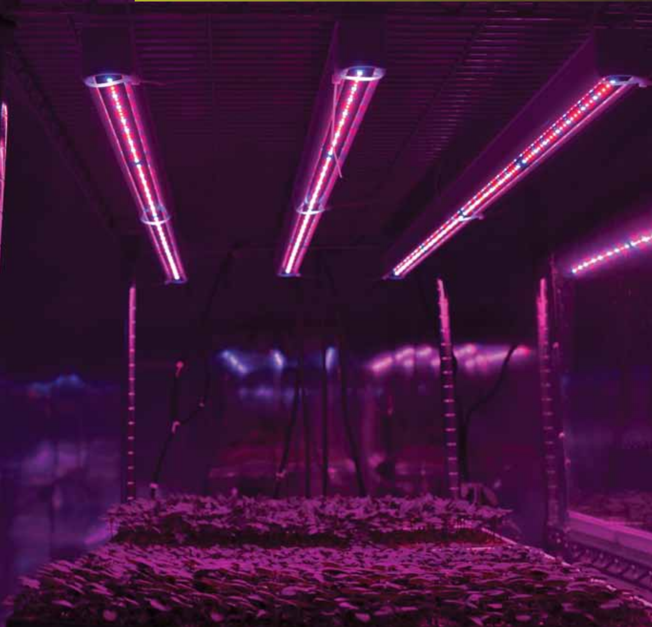
Figure 2. Sole-source indoor vertical production of plugs using LEDs delivering (%) 88:12 red:blue light with a photosynthetic photo flux (PPF) of 185 \mu\text{mol}\cdot\text{m}^{-2}\cdot\text{s}^{-1} at canopy level.

gated with 100 ppm nitrogen (Jack's 16-2-15 LX Plug Formula for High Alkalinity Water).