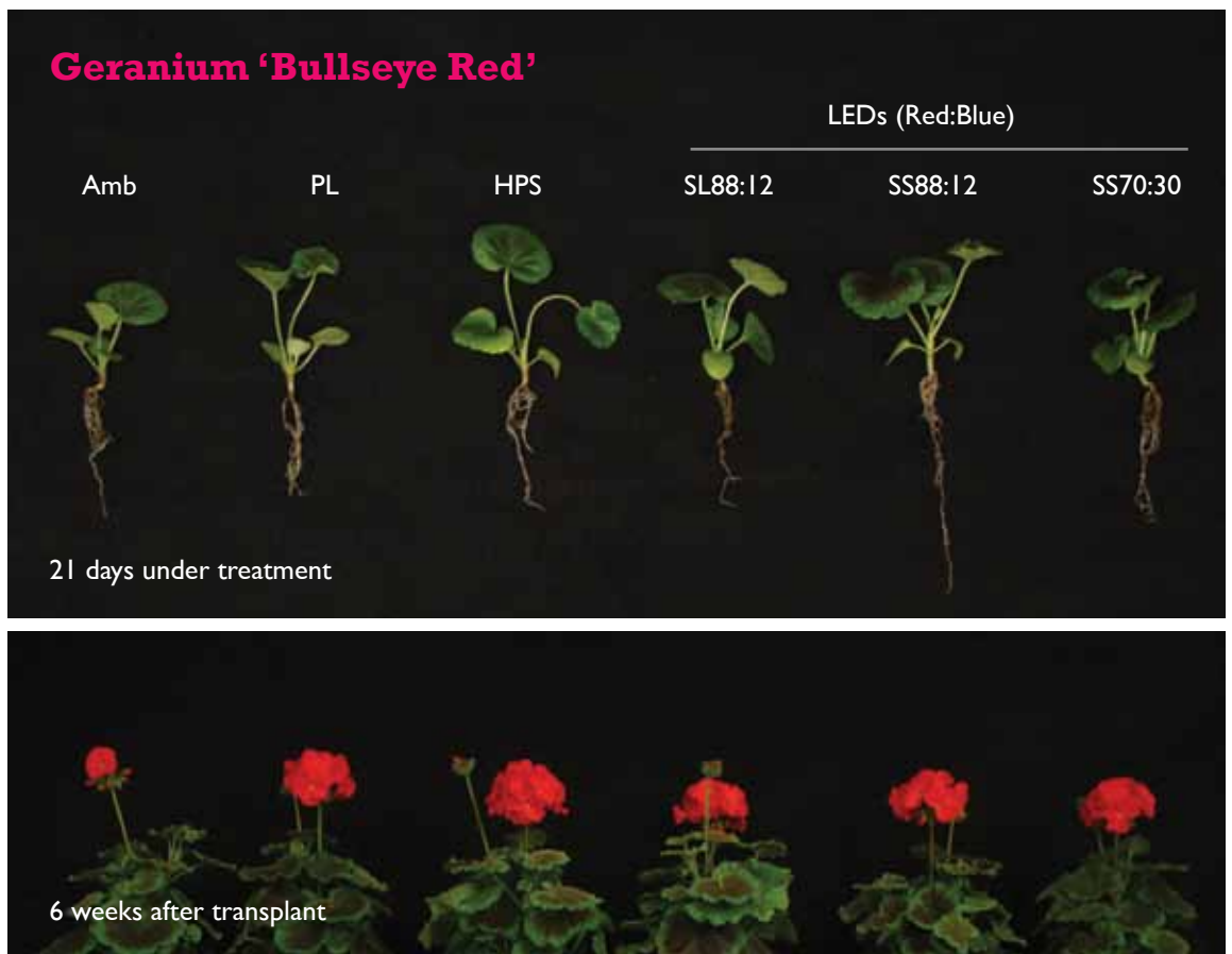
Figure 5. Plug quality and subsequent flowering of geranium plugs grown under ambient solar light, supplemental lighting (SL) from plasma lamps (PL), high-pressure sodium lamps (HPS) and LEDs (SL88:12) delivering 70 \mu\text{mol}\cdot\text{m}^{-2}\cdot\text{s}^{-1} or sole-source (SS) LEDs (SS88:12 and SS70:30) in a vertical production system delivering 185 \mu\text{mol}\cdot\text{m}^{-2}\cdot\text{s}^{-1} .